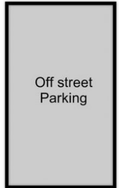
(Not in position)