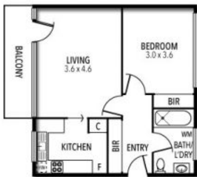
UNIT 4 & 6