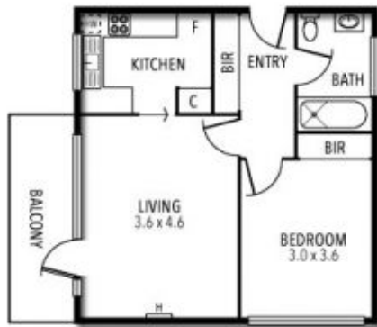
UNIT 3 & 5