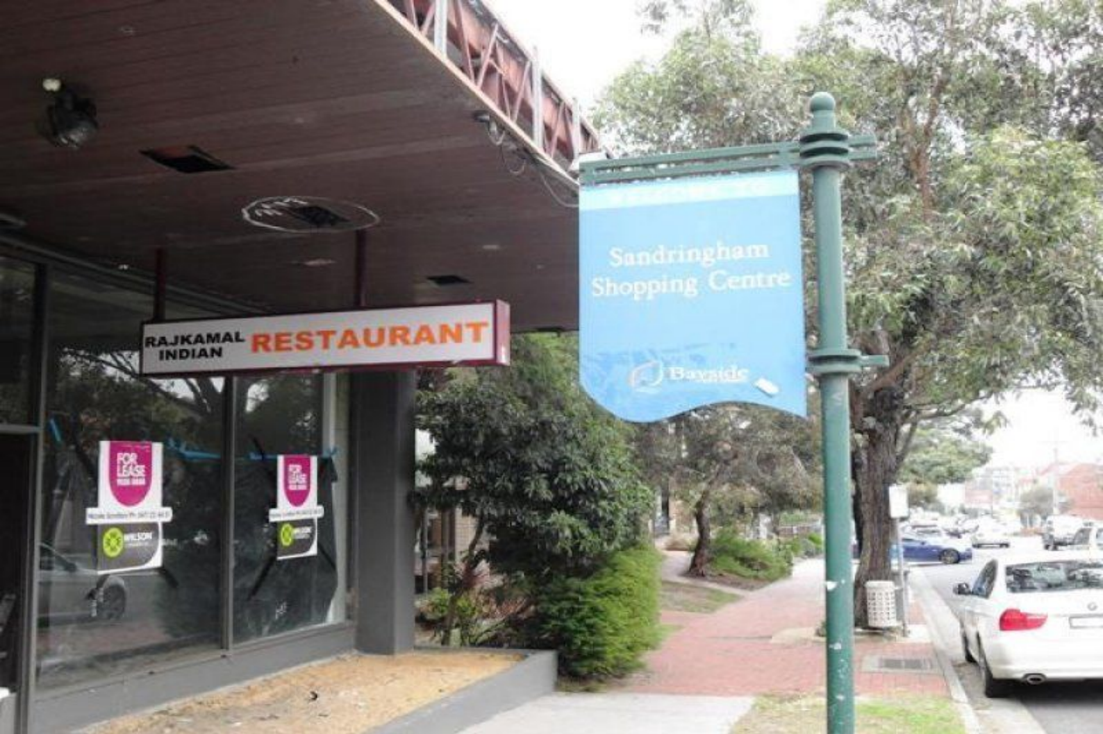
62 Bay Rd, Sandringham